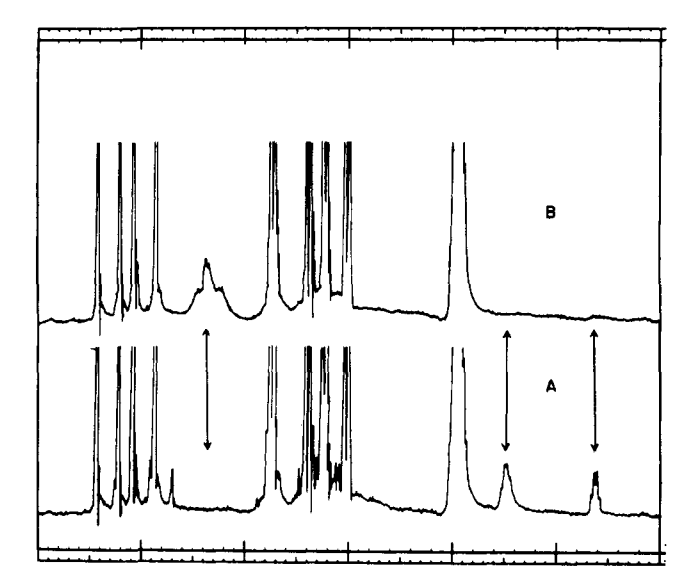
Figure 2. Vinyl region of nmr spectrum of I in sodium hydroxide coated tubes: A, before heating; B, after 3 days at 140°.

(19) S. J. Rhoads and J. M. Watson, J. Amer. Chem. Soc., 93, 5813